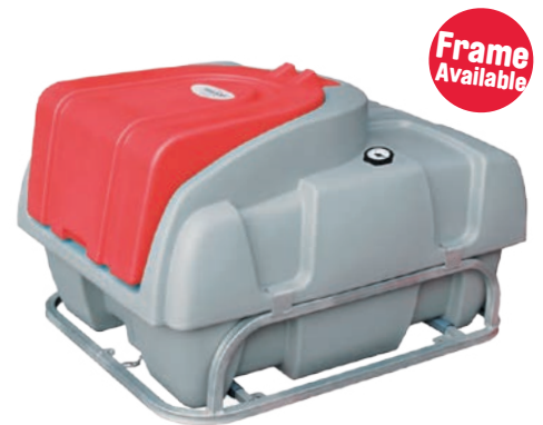
DMP200 > With DM200MF

Ideal for mounting to any size ute tray -No extra space required. See details on page 10