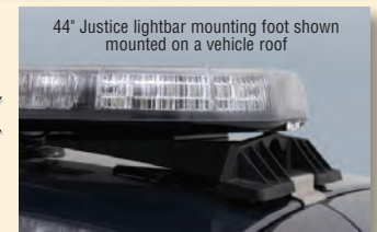
44" Justice lightbar mounting foot shown mounted on a vehicle roof

JC & JE Competitor Series with four corner Linear-LED® modules offering front, rear and all bar operational control of lightbar.