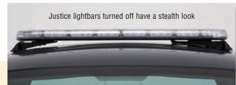
Justice lightbars turned off have a stealth look