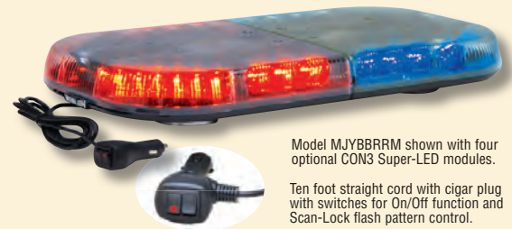
Model MJYBRRM shown with four optional CON3 Super-LED modules.

Ten foot straight cord with cigar plug with On/Off function and Scan-Lock flash pattern control.